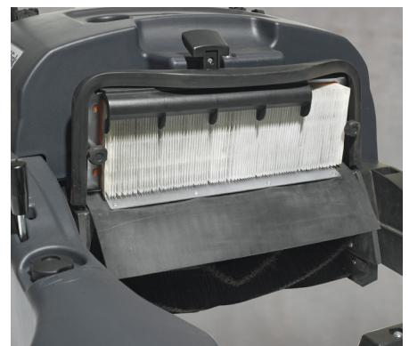
Thanks to the polyester filter the SW 750 can be used in both dry and humid areas.