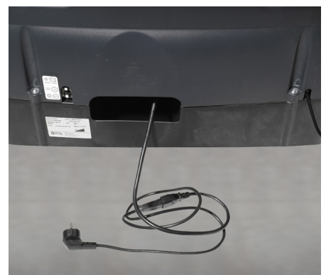
The plug-in onboard battery charger ensures continuous and hassle-free operation.